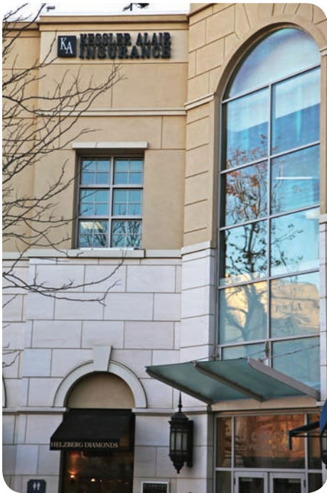
Victoria Gardens 12487 N. Mainstreet, Suite 240 Rancho Cucamonga, CA 91739

Happy New Year to you from Kessler Alair Insurance Services!