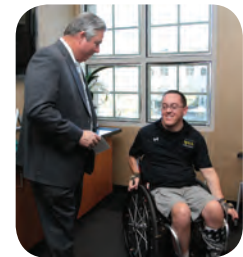
May 2014 be a great year for everyone!

At the beginning of each year, we recognize outstanding achievement from the prior year and announce new goals for the future. Many producers and customer service representatives were recognized for their outstanding work. Most importantly we were able to present a check to the Be Perfect Foundation for the funds raised in 2013 from our Bat-a-thon and "Jars for Change".